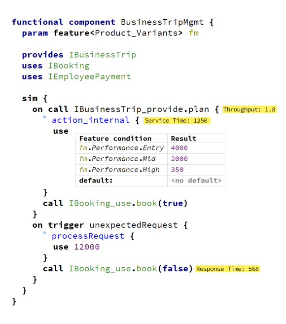
Figure 2: A sample component in the IET_S^3 notation, supporting calls (regular component connections), triggers (performance analysis specific methods) and variant specific resource demands. The yellow boxes show attached analysis results.

the two modeling languages exist (e.g. processor configuration).